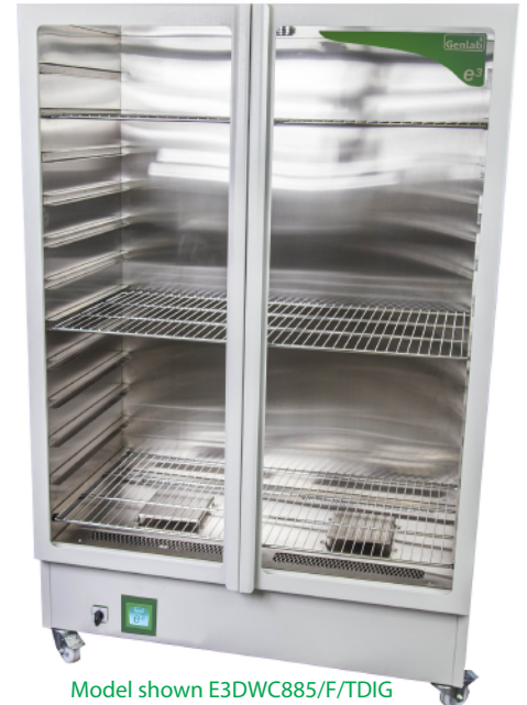
Model shown E3DWC885/F/TDIG

Genlab is proud to offer their customers a unique range of sustainable laboratory products and services. e 3 is our market leading brand for scientifically developed, cutting edge, sustainable, eco-friendly products. Genlab's new e 3 range of glassware drying cabinets are energy efficient, safer and economic to run. Working with the University of Cambridge, we developed units that represent a novel, sustainable solution to glassware drying. They feature our latest touch screen control system, which offers intuitive control and excellent accuracies with bespoke firmware for energy saving control, including adjustable automatic on/off times.